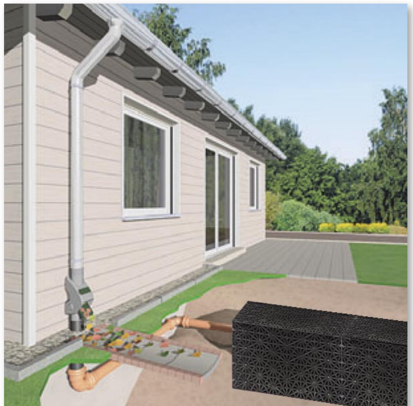
Detail of Down Pipe Filter connected to Matrix® tank system.