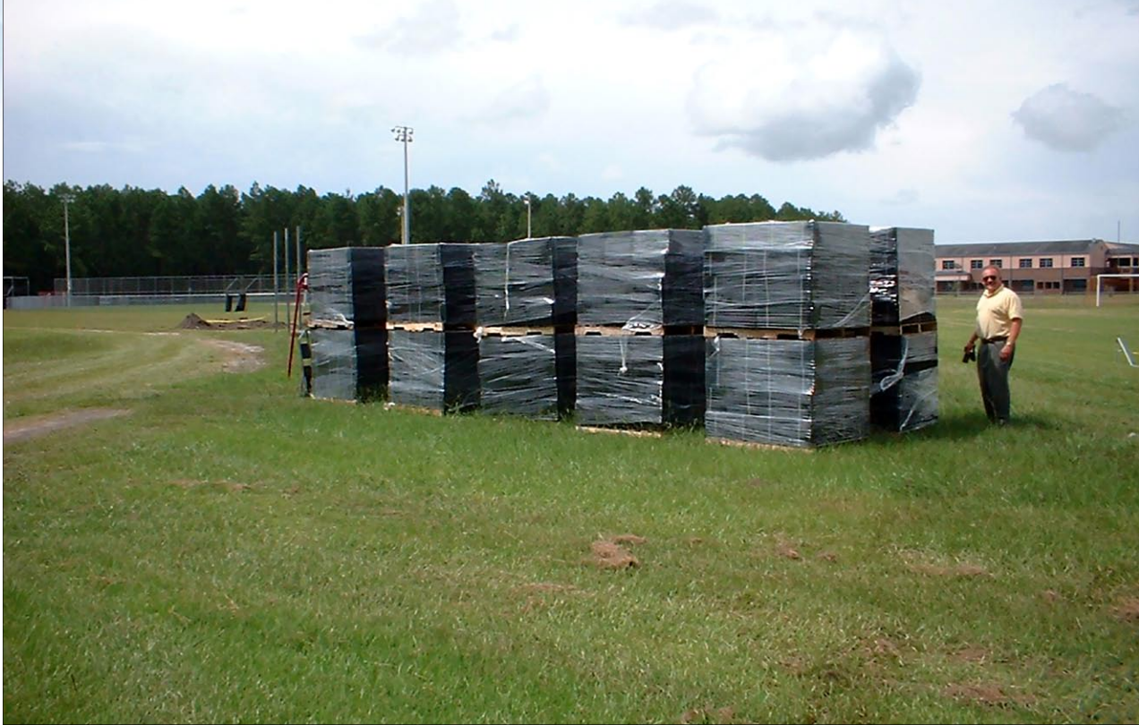
The Atlantis ® Drainage Cells ready to be installed.