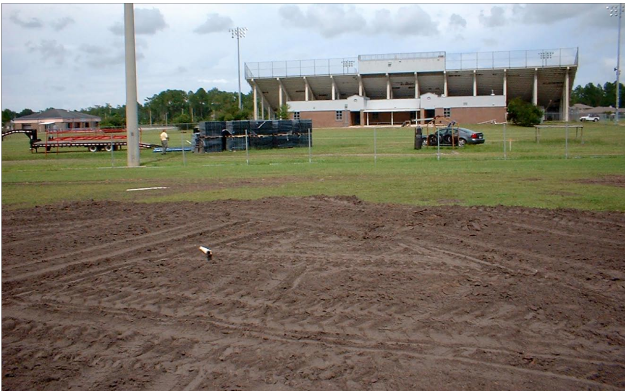
Excavation preparation for the Atlantis ® Drainage Cells.