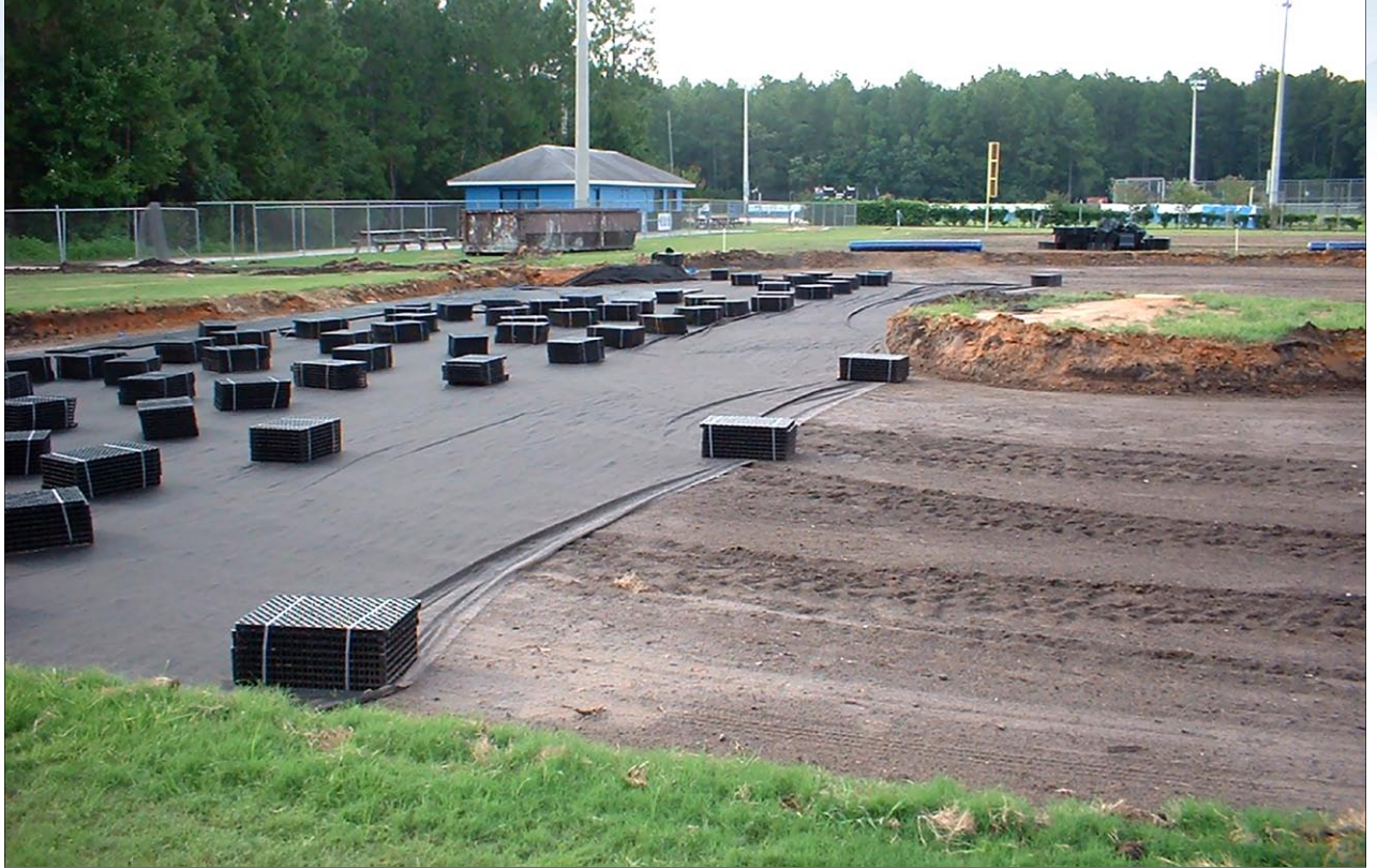
Installing the Atlantis ® Drainage Cells on top of the Geotextile.